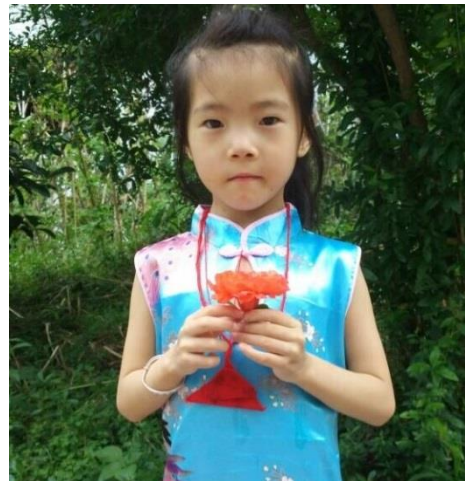
July 2015: Post-surgery