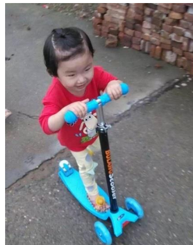
June 2015: Post her fourth esophageal dilation.