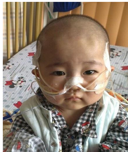
March 2015: Prior to one of his many surgeries